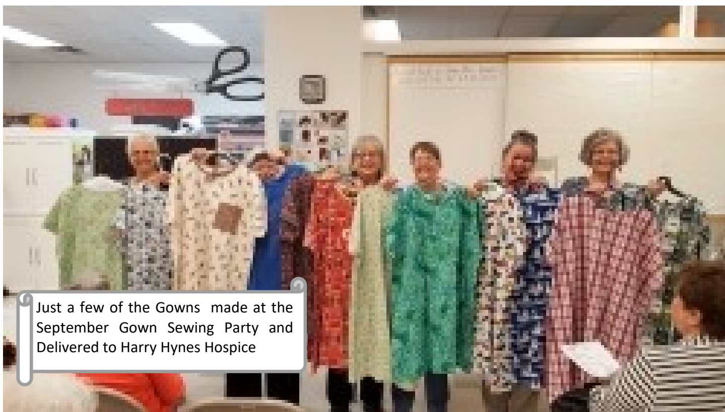
Just a few of the Gowns made at the September Gown Sewing Party and Delivered to Harry Hynes Hospice