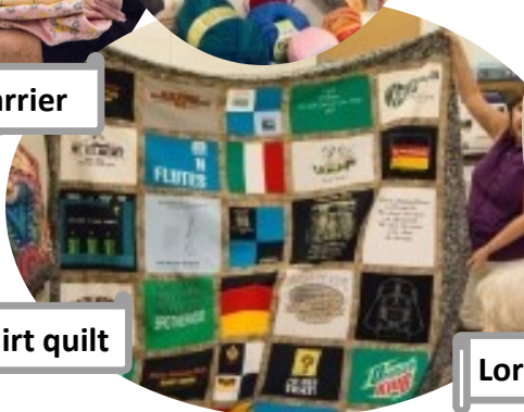
Julia Waterbury /t-shirt quilt