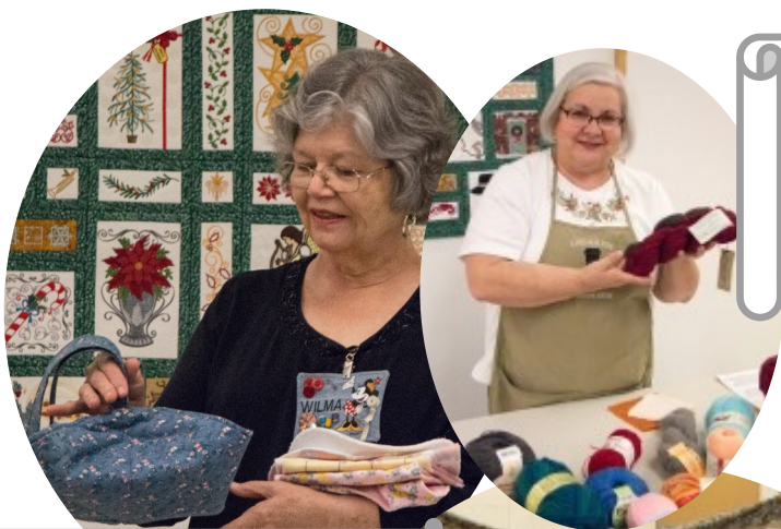
Wilma Wine /Casserole Carrier