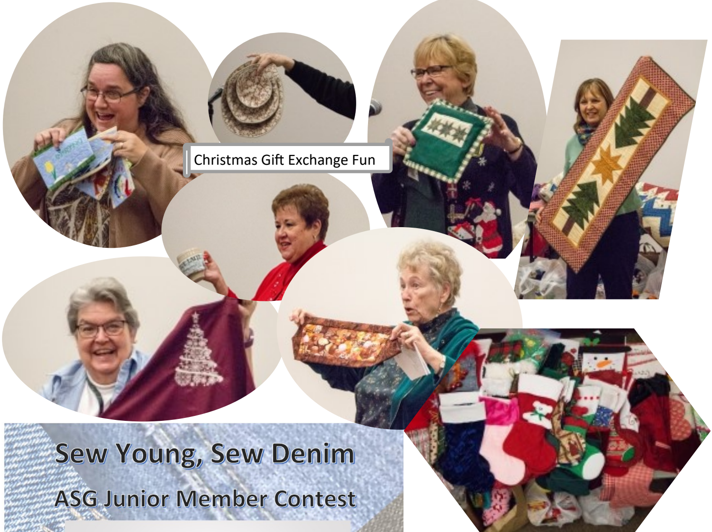
Christmas Gift Exchange Fun