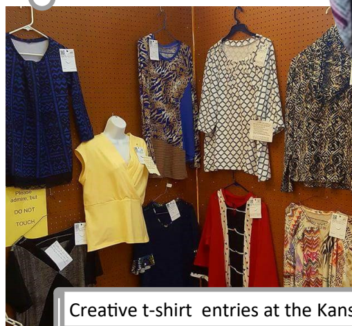
Creative t-shirt entries at the Kansas State Fair