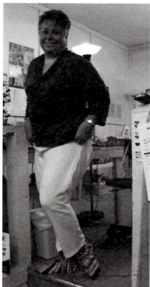
Busy, busy, busy. House-shoes in October...