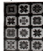
Star Block Kit