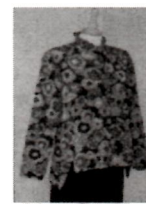
Liberty Shirt Kit Project Sewing Workshop