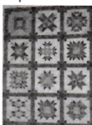
Star Block Kit