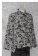
Liberty Shirt Kit Project Sewing Workshop