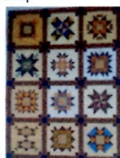
Star Block Kit