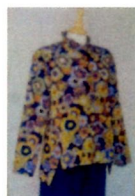
Liberty Shirt Kit Project Sewing Workshop