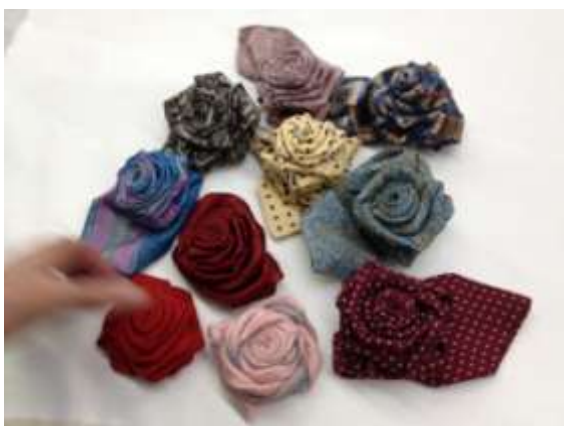
Necktie Flowers, East Side NG