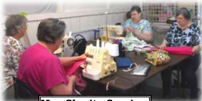
May Charity Sew-in