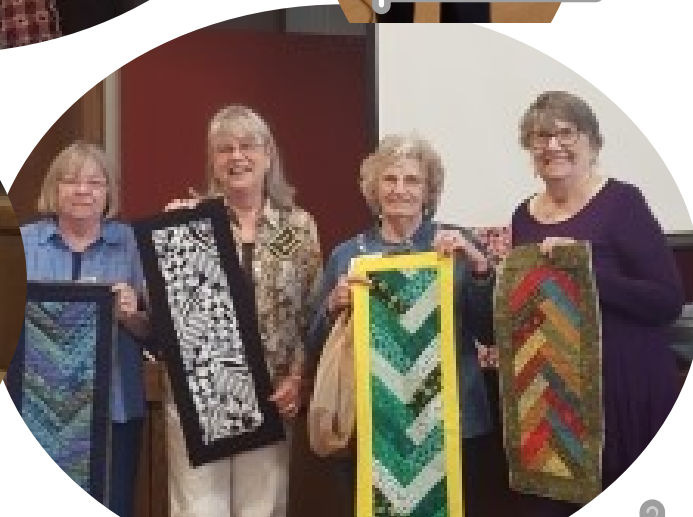
Table Runners made in the Serger Neighborhood Group