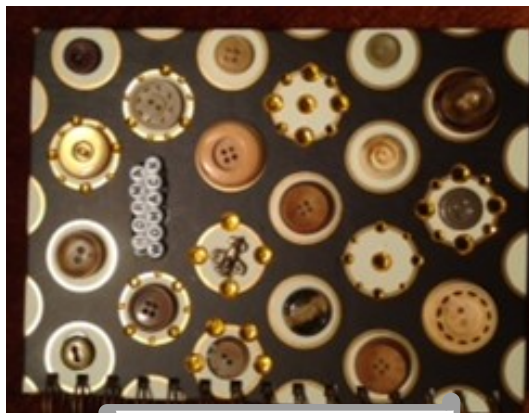
Norma's New Notebook