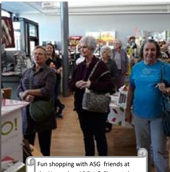
Fun shopping with ASG friends at the November 16 Eat & Shop at the Beehive Quilt and Toy Shop in Wel- lington .