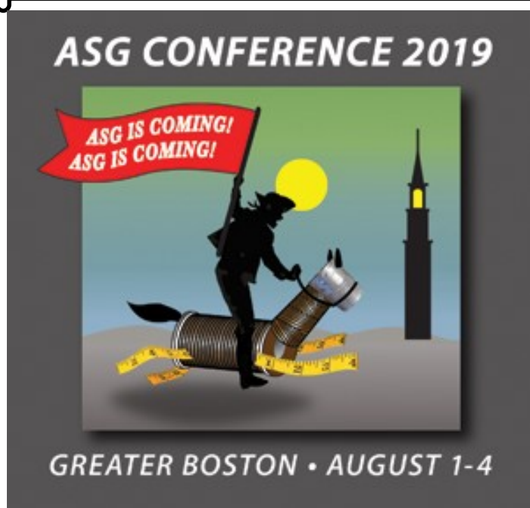
DoubleTree by Hilton Hotel Boston North Shore