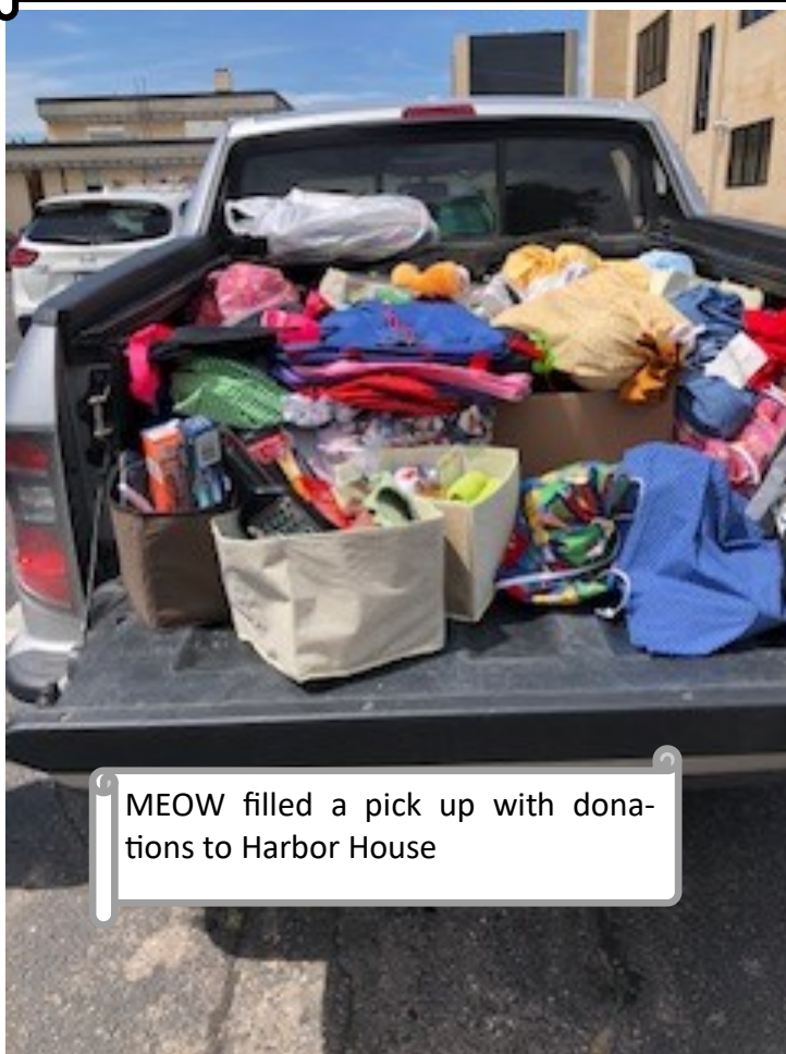
MEOW filled a pick up with donations to Harbor House