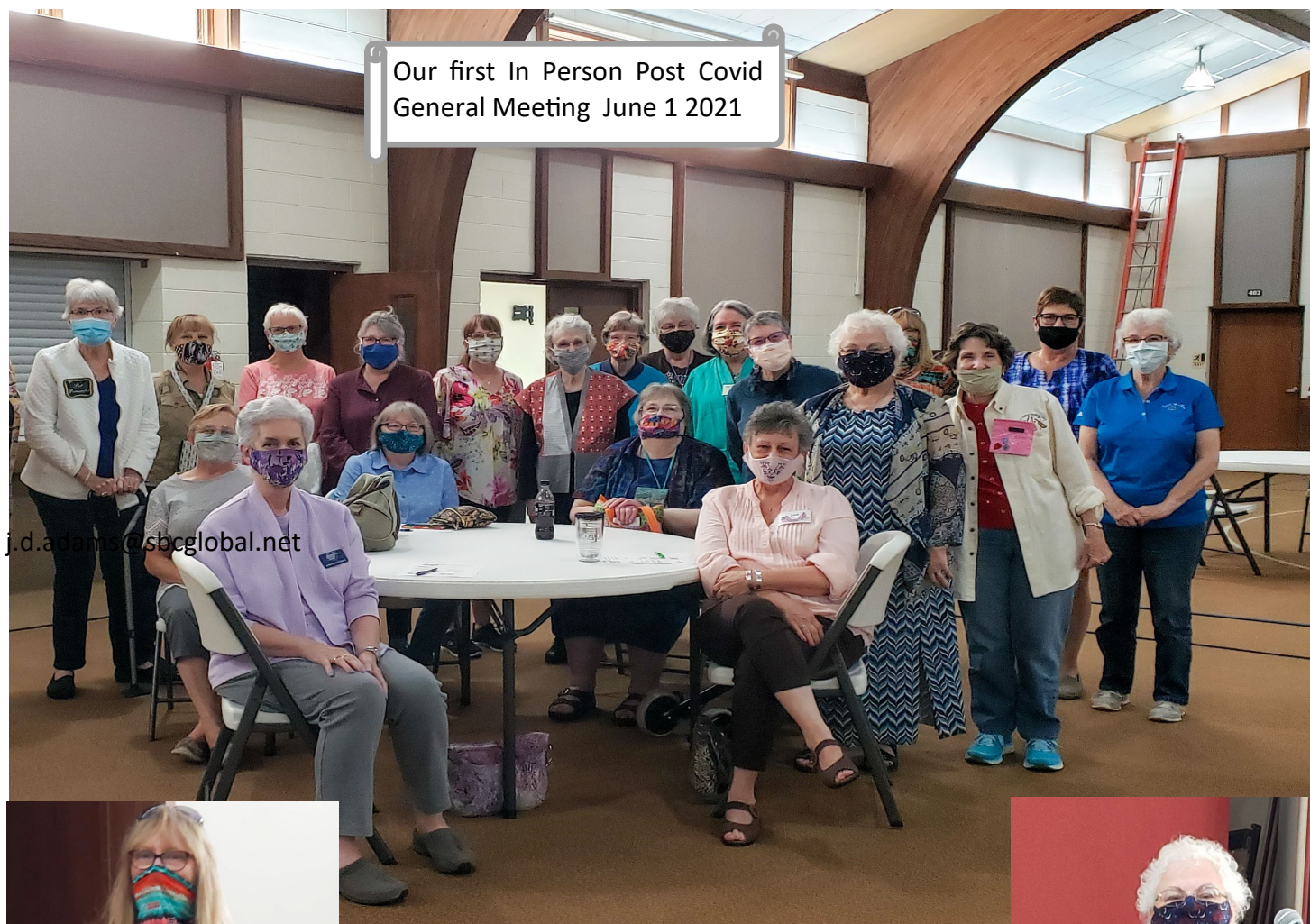
Our first In Person Post Covid General Meeting June 1 2021