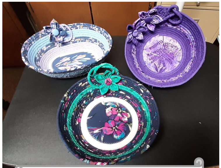
Wrapped rope bowls were the focus of the September Sew Inspired Neighborhood group. A great Christmas idea.