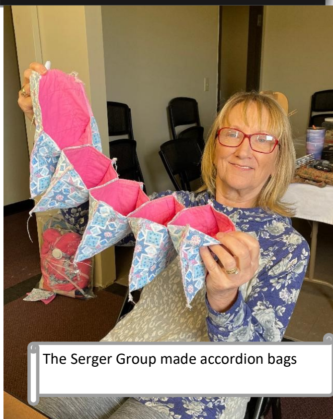
The Serger Group made accordion bags