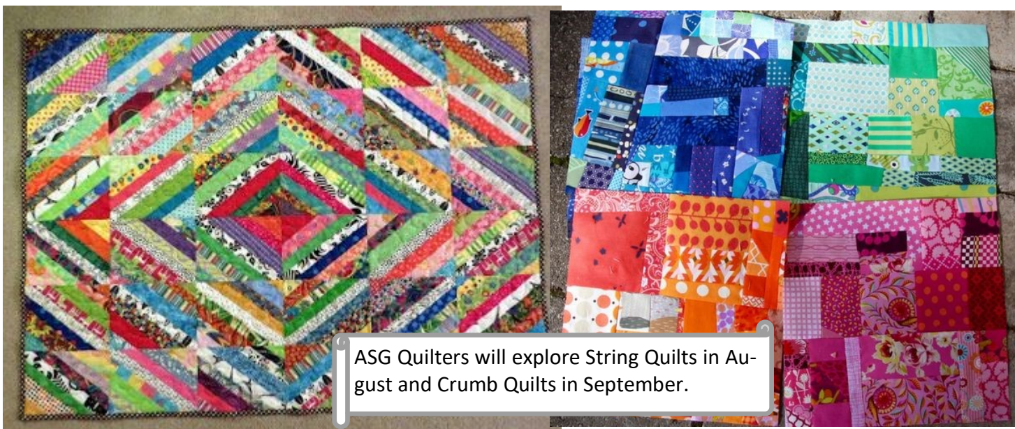
ASG Quilters will explore String Quilts in August and Crumb Quilts in September.