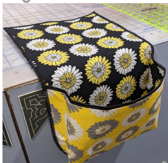
The Serger Group made scrap bags in May