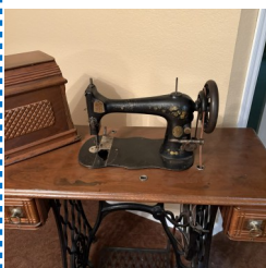
Singer with Treadle/Box $75